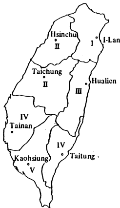
Fig. 1. Map of Taiwan showing the localities and the intensity of catching brown planthopper with light trap.

Throughout the province, seven districts' agricultural improvement stations have been divided from north to south and from west to east; they are Taipei District (including Ilan), Hsinchu District, Taichung District, Hualien District, Tainan District, Taitung District and Kaohsiung District (Fig. 1). According to the 5-days average amount of pests trapped with light